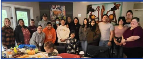
DTI Mental Health and Wellness Meadow Lake Cohort